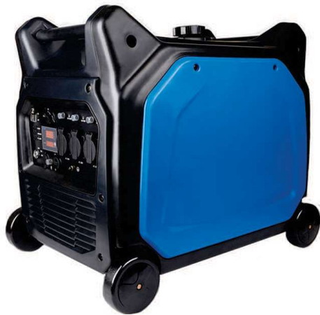
"Silent Type" Inverter Generator.

ALWAYS earth the unit, and NEVER use a reverse plug to connect to your plugs - either connect to your distribution board, or else power your appliances directly from the generator.