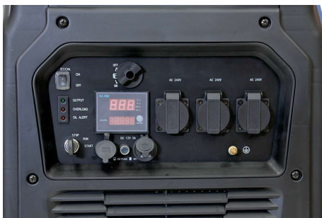
Digital display, electric start.